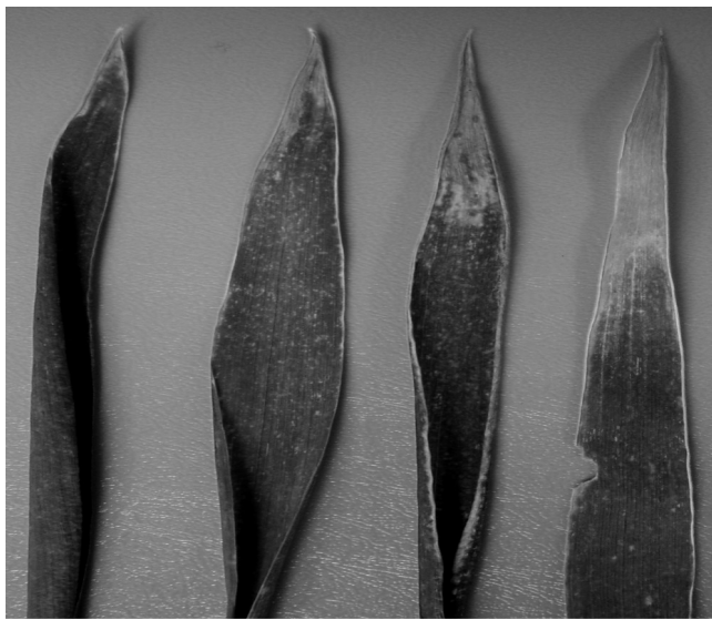
1 2 3 4 *1: Low LTN, 2: Medium LTN, 3, 4: High LTN