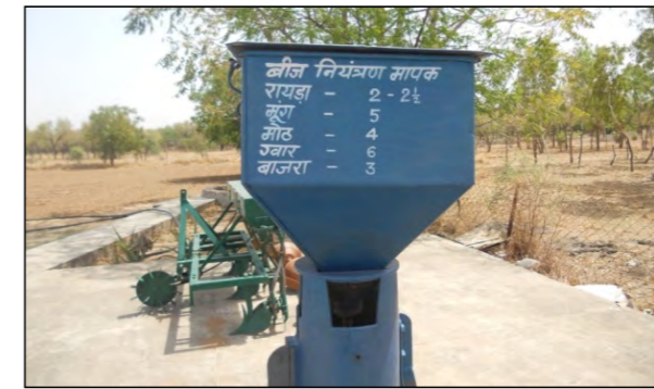
Fig. 2. Seed rate marked on seed box.

The improved traditional seed drill with a metering system was calibrated for proper seed rate. The bit and bush assembly was set to regulate the openings for uniform metering of different shapes and sizes of seeds. The press wheel assembly was also adjusted on a frame to provide uniform pressure in each furrow throughout its field operation.