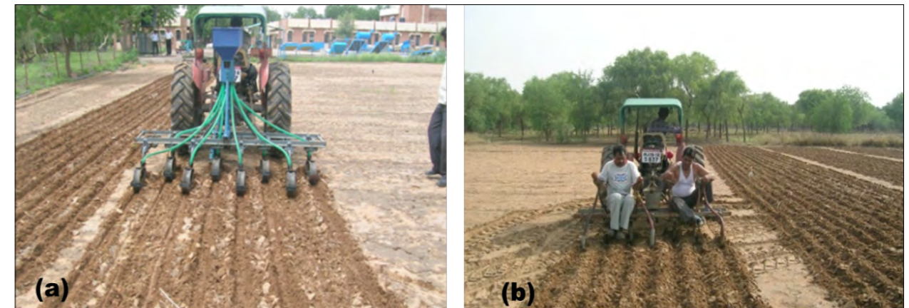
Fig. 3. Sowing by improved traditional seed drill (a) and sowing by traditional seed drill (b).

Performance of the improved traditional seed drill was tested in the laboratory for pearl millet, mung bean, moth bean, clusterbean and mustard seeds. The bit of the metering device was equally divided and marked (Fig. 2). The adjustment of bit was given on the seed box as per the shape and size of seeds to maintain its seed rate under field conditions. To test the hypothesis that the improved seed drill and traditional sowing method means at different