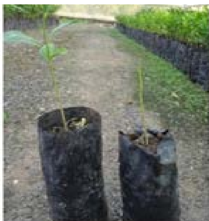
Preparation of rootstock