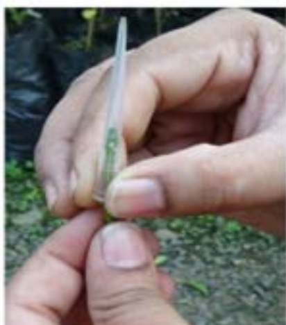
Covering with micropipette cap