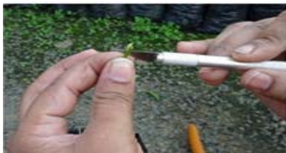
Wedge cut for inserting bud