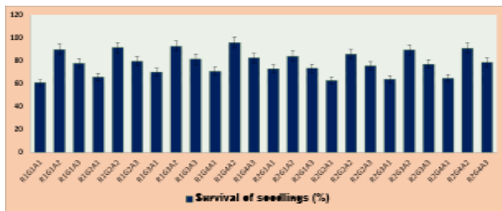
Fig. 1: Survival of seedlings (%) as influenced by growing media and age at the time of microbudding