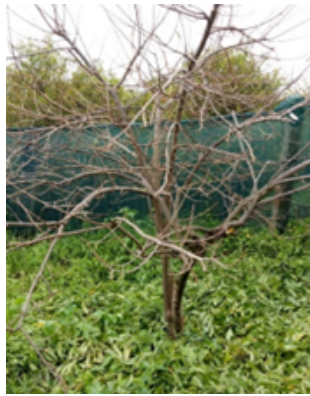
Picture 1. Defoliated tree