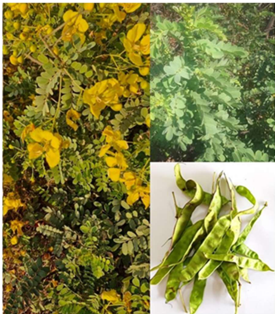
Fig. 4. Plant parts of Tanner's Senna of Kutch (Kutchi Aval)

compounds, including alkaloids, glycosides, saponins, polyphenols, tannins, phlorotannins, terpenoids, triterpenes, carbohydrates, proteins, amino acids, anthraquinones, aloe-emodin, and sitosterols. The plant's leaves and stems are commonly used as alternatives to S. angustifolia (Tinnevely Senna), especially for extracting sennosides and in hair dye formulations with henna. These phytoconstituents are linked to therapeutic effects, notably in managing diabetes mellitus and other health conditions (Prasathkumar et al., 2021; Nille et al., 2024).