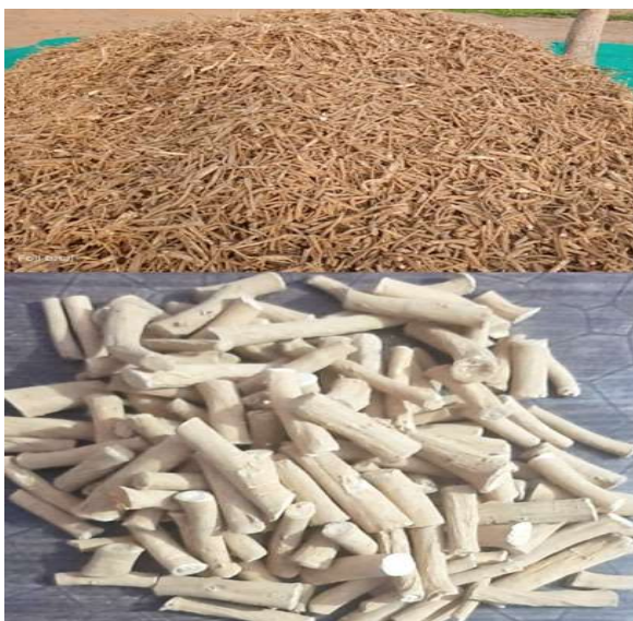
Fig. 1. Roots of Nagori Ashwagandha

The genotype demonstrates exceptional performance in terms of both biomass production and phytochemical yield when cultivated in the wetland agro-ecology of this region. This variety is particularly suited for commercial cultivation due to its high dry herbage yield potential (up to 170 q/ha) and elevated Bacoside A content, meeting and exceeding industrial quality standards (≥1.5%) (Fig. 3).