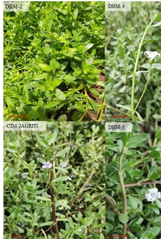
Fig. 2. Brahmi germplasm DBM-4 vs CIM Jagriti (Check)