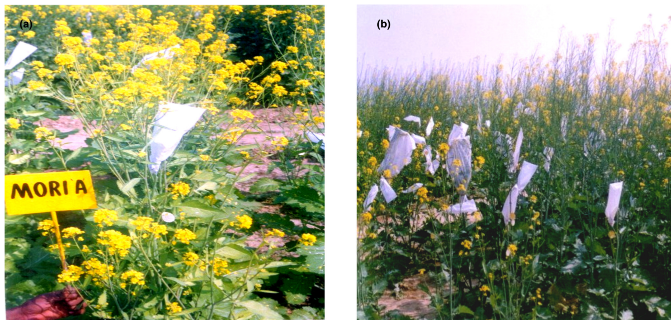
Fig 3 (a) Chlorotic mori CMS, (b) corrected mori CMS

mainly used as an animal feed. Seed meal has also potential use as manure and also being exported.