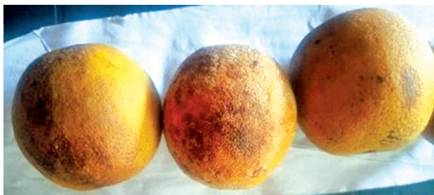
Fig 1 Symptoms on orange fruits caused by post-harvest rots: Brown and dark lesions and stem-end rot.

Penicillium sp. and Fusarium sp. after 7 days of incubation using poison food technique. The different treatments with aqueous extracts exhibited a significant reduction in mycelium growth. The highest inhibition percent was registered for Aspergillus sp. I, Aspergillus sp. II, Penicillium