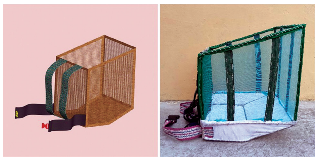
Fig. 1 3D model developed using SolidWorks and the developed basket.

Body part discomfort analysis: To evaluate physical strain of workers during tea plucking, their subjective responses to task demands were scored by using Body Discomfort Scale. A modified version of (Corlett and