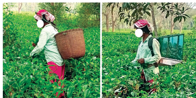
Fig. 2 Tea plucking worker working with the traditional and developed basket.