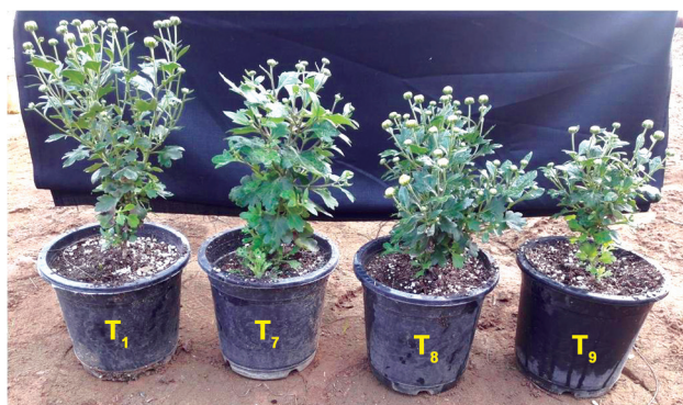
Fig 2 Influence of daminozide @ 500, 750 and 1000 ppm (T 7 , T 8 , T 9 , respectively) on plant height at first bud appearance in comparison to control plant (T 1 )

It was observed that days to bud appearance (80.56 days), days to colour break stage (103.66 days) and days to full bloom stage (123.56 days) were significant lower in T 9 (Daminozide @ 1000 ppm) followed by T 8 (Daminozide @ 750 ppm) and T 7 (Daminozide @ 500 ppm) while maximum in T 12 (Ethephon @ 1000 ppm).