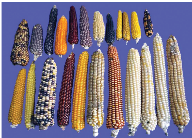
Fig 1 Maize collections showing variability in ear size, kernel colour and kernel type

be utilized for diversifying the pools and deriving inbred lines with diverse specific features, prolific popcorn and sticky inbred lines as Chinese landraces were also used for inbred development and hybrid maize breeding (Li 1998).