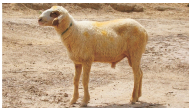
Fig. 1. Chitarangi male

after alignment to a minimum of 1041 bp. All positions containing gaps and missing data were eliminated from the dataset. DNA SPv6 (Rozas et al. 2017) was used to analyze polymorphic sites, number of haplotypes (h), nucleotide diversity ( \pi ) and haplotype diversity (Hd). Median joining network was generated using the Network 5.0.0.3 software ( http://www.fluxus-engineering.com ) to explore relationship among the observed haplotypes.