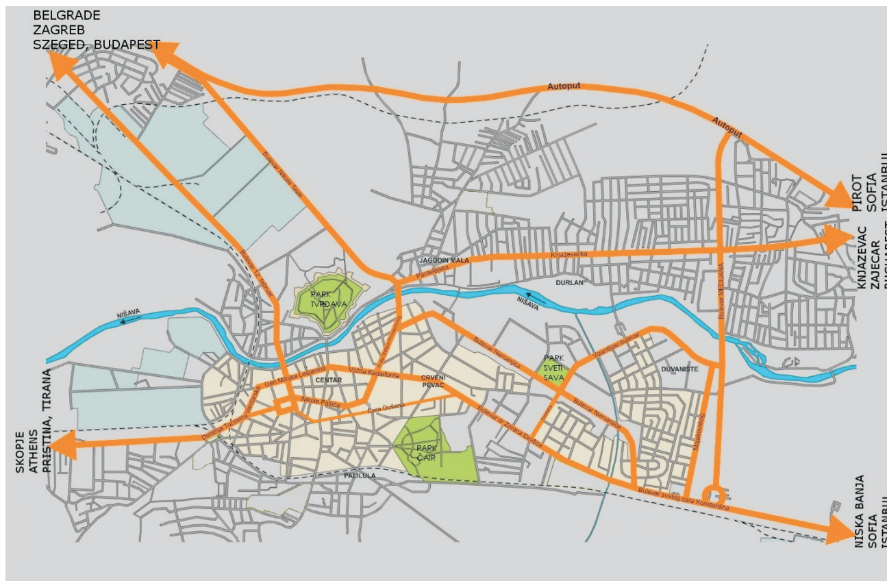
Fig. 1. Geographic position of the city of Niš and the parks included in the research.

Samples: The faeces of dogs were collected in the form of individual and group samples, from the locations where the concentration of faeces was the largest and where it was determined by a macroscopic insight that it was freshly defecated. The number of collected samples was conditioned by the size of the locality and the level of visible contamination by dog faeces. The samples of dog faeces were packed in plastic bags and adequately labelled (date of sampling, location, number and type of sample). They