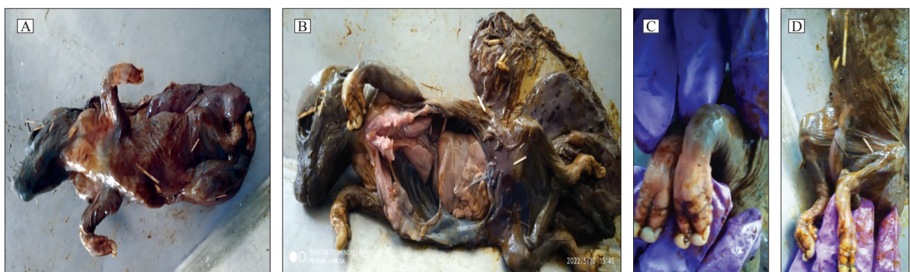
Fig 1. A. Partially dehydrated, dark brown foetus with shrunken eyes; B. Partially dehydrated, completely developed visceral organs; C-D. Curled up hooves in both fore limbs and hind limbs.

It is noticed that no further cases have been reported after taking proper precautions by initiating vaccination against PCV2 in pigs in the farm. This is suggestive of possible involvement of PCV2 as primary causative agent for the reproductive failure in sows/ gilts. Proper implementation