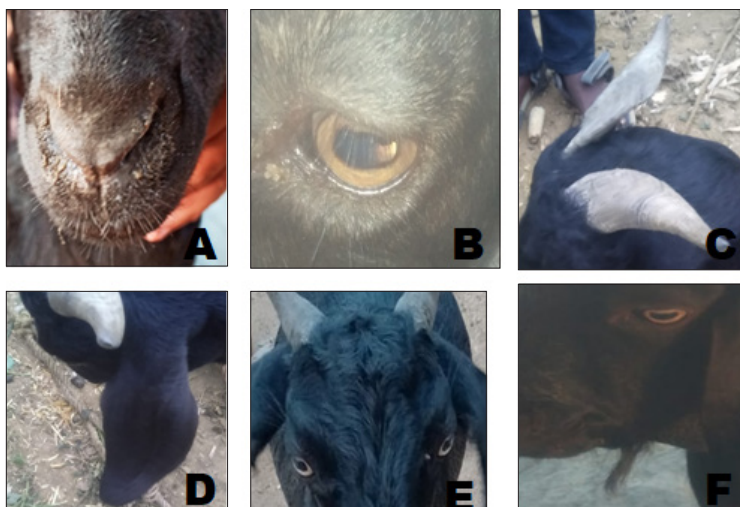
Supplementary Fig. 1. Phenotypic characters in black variant. A. Muzzle colour; B. Eyelid colour; C. Horn pattern; D. Ear pattern; E. Head profile; F. Beard.

Received: 18 March 2024; Accepted: 21 May 2024