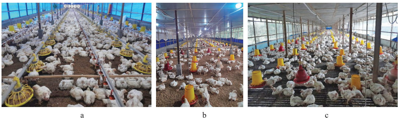
Fig 2. Broilers reared in three different house types: (a) CH-LF= closed house with concrete deep litter floor, (b) OH-LF= open side house with concrete deep litter floor, and (c) OH-SF= open side house with stage slatted floor

a, b means in the same row with different superscripts indicated significantly different ( p < 0.05 ); A, B means in the same row with different superscripts indicated very significantly different ( p < 0.01 ); FI = feed intake, WFI = weekly feed intake, FBW = final body weight, BWG = weekly body weight gain, FCR = feed conversion ratio, DR = depletion rate, PI = performance index SEM = standard error of means; CH-LF = closed house with concrete deep litter floor, OH-LF = open house with concrete deep litter floor, OH-SF = open house with stage slatted floor