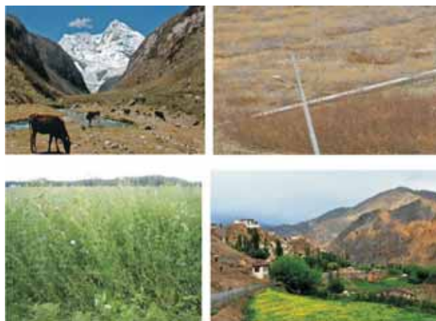
Fig. 2. Barren lands covered with unknown grasses, lucerne, and grain crops (left to right) during summer.

At high altitude, agricultural practices are badly affected due to the hostile environment that lead to low fodder production. The district has 10,196 ha land under cultivation. Average holding size is about 1.377 ha. Holdings are mostly of small size, 46.36% are less than 1 ha, 38.44% between 1 and 3 ha, and 15.2% are above 3 ha. However, land under fodder cultivation is 2,095 ha, which is approximately 20% of net cultivable land (District Land Department 2010–11). Hence, limited cultivable land for