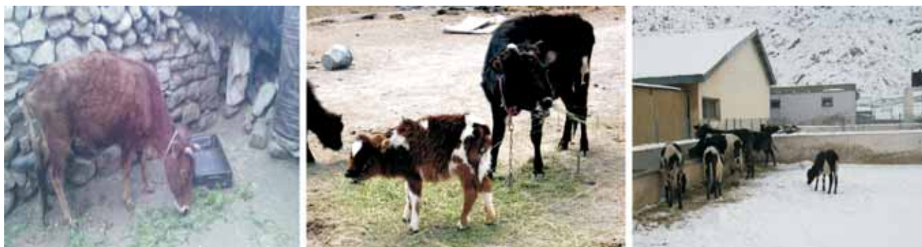
Fig. 3. Stall feeding of dairy cattle.