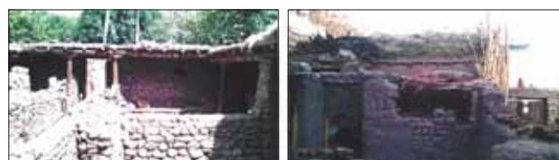
Fig. 4. Housing system in Ladakh for dairy cattle and other livestock.

*All the values are expressed on dry matter basis.