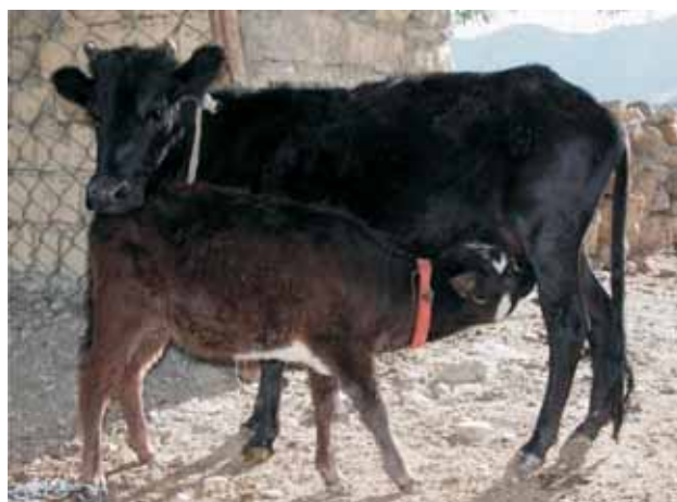
Fig. 5. Local Ladakhi cow.

In the recent years, climate change has further aggravated the problems for livestock productivity at high altitude. We have observed extension of the summer period, early or late change of winter or summer, higher UV radiation, increased rainfall, low snowfall during winter or summer snowfall, melting of glaciers, etc that are severely affecting the agricultural practices, livestock rearing and their health. Evidence from the Intergovernmental Panel on Climate change (IPCC 2007) is now overwhelmingly convincing that climate change is real and most vulnerable to agriculture and animal husbandry practices. Further, due to climate change, high environmental temperature impairs production and reproductive performance, body homeostasis, and metabolic and immune status of dairy cattle (Broucek et