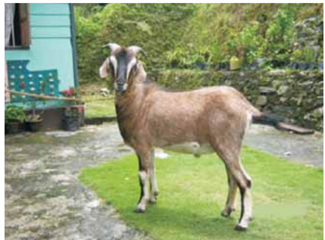
Fig. 1. A Singharey buck.

Efforts were made to collect the blood from Singharey goats of different genetic background. This was authenticated by applying the breed assignment test (Verma et al. 2015a) which assigned about 90% Singharey goats to Singharey group. The estimates for allele number, heterozygosities, inbreeding, polymorphic contents are given in Table 1. A total of 182 alleles were observed across the studied loci. The number of observed alleles varied from 3 (RM4) to 12 (ILSTS033, ILSTS029, ILSTS30 and ILSTS082) with an overall mean of 7.913 \pm 0.576 which corroborates with the mean number of alleles reported in Ganjam goat (6.29) by Sharma et al. (2009), however, it is less than Gohilwari goat (10.12) observed by Kumar et al. (2009). The observed number of alleles across the loci was more than the effective number of alleles (1.449 to 6.969) as per expectations. All the studied micro-satellite loci exhibited polymorphism, which indicated that the genetic markers used were also suitable for genetic studies of Singharey goats.