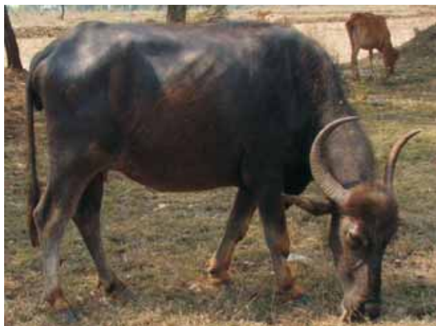
Fig. 1. Adult female Chhattisgarhi buffalo with typical phenotype and Characteristic horn orientation. The area in red indicates the breeding tract of these buffaloes in India.

81.0755°E Longitude. Buffaloes in Chhattisgarh constitute 14.5% of the total livestock in the state. Murrah and Nagpuri buffalo are the only registered breeds of buffalo available in the state. About 93.67% of buffaloes in the state are non-descript (DAHD&F 2013) which may include Chhattisgarhi buffaloes along with extant breeds and their grades.