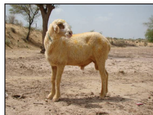
Fig. 1. Chitarangi Male

Phenotypic characteristics: Chitarangi animals are medium to large in size. The coat colour and face is white with tan colour patches around eyes, muzzle and distal end of the ear pinna. The light brown, chocolate and black colour patches were also seen in flocks. Ears are large in size and leafy. Serrations of different shape and depth are available on distal end of ear pinna in all the animals, which is a characteristic feature of this breed. The length of ear ranges from 12 to 24 cm. Both the sexes are polled, however, horns were observed in few males. Tail is medium in length (Fig. 1 and 2) and thin. The udder is medium sized and developed