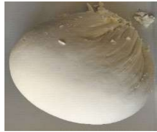
Bacterial culture curd mass