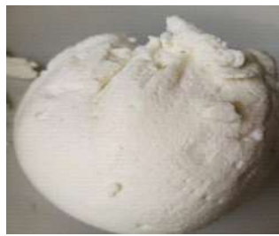
Mixed culture curd mass