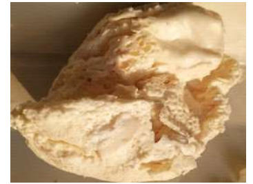
Yeast culture curd mass

cillus both of which act on lactose to produce lactic acid. The T3 evinced significantly ( P \leq 0.05 ) highest pH values among all.