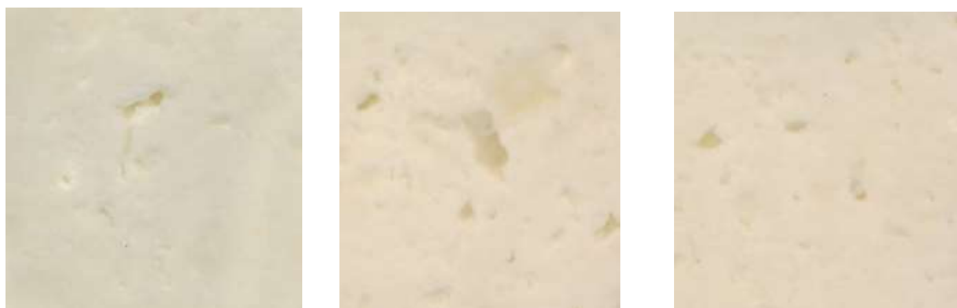
(a) Control sample, PC1