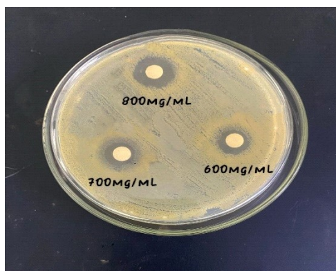
Fig. 1 Zone of inhibition against S. aureus