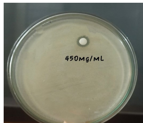
Fig. 4 The minimum zone of inhibition against S. aureus