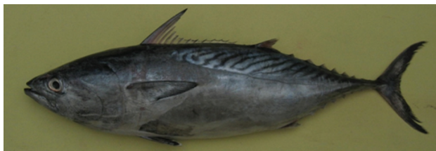
Fig. 8. Auxis thazard (Lacepède, 1800)

Auxis thazard (Lacepède, 1800) (Fig. 8; Table 1)