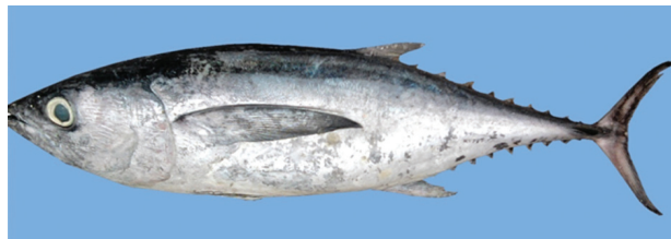
Fig. 3. Thunnus tonggol Bleeker, 1851

Thunnus tonggol (Bleeker, 1851) (Fig. 3; Table 1)