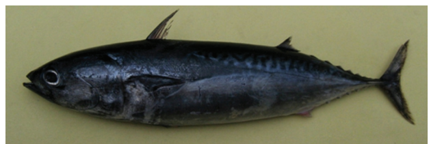
Fig. 7. Auxis rochei (Risso, 1810)

Auxis rochei (Risso, 1810) (Fig. 7; Table 1)