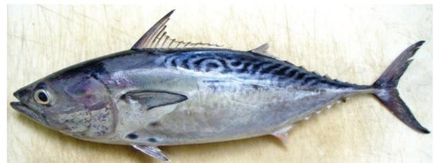
Fig. 1. Euthynnus affinis (Cantor, 1849)

Euthynnus affinis (Cantor, 1849) (Fig.1; Table 1)