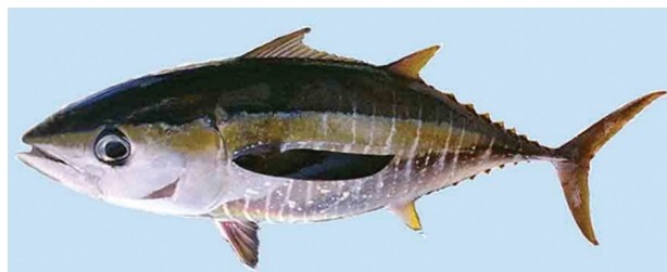
Fig. 4. Thunnus obesus (Lowe, 1839)

Thunnus obesus (Lowe, 1839) (Fig. 4; Table 1)