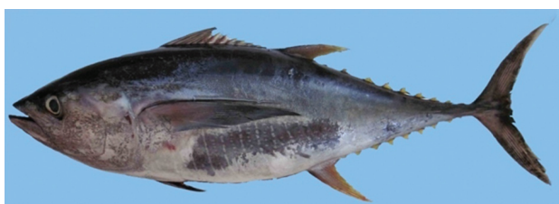
Fig. 2. Thunnus albacares (Bonnaterre, 1788)

Thunnus albacares (Bonnaterre, 1788) (Fig. 2; Table 1)