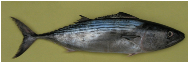
Fig. 5. Sarda orientalis (Temminck & Schlegel, 1844)

Sarda orientalis (Temminck & Schlegel, 1844) (Fig. 5; Table 1)