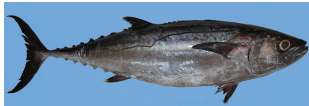
Fig. 9. Gymnosarda unicolor (Rüppell, 1836)

Gymnosarda unicolor (Rüppell, 1836) (Fig. 9; Table 1)