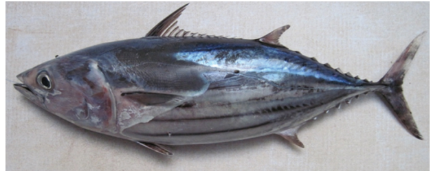
Fig. 6. Katsuwonus pelamis (Linnaeus, 1758)

Katsuwonus pelamis (Linnaeus, 1758) (Fig. 6; Table 1)