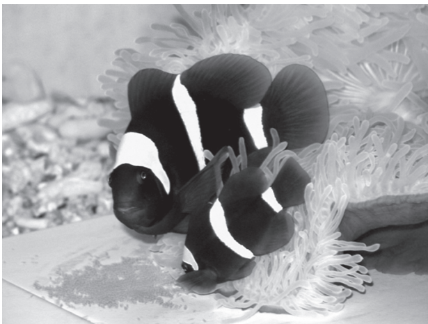
Fig. 1. A pair of Premnas biaculeatus guarding the newly spawned eggs