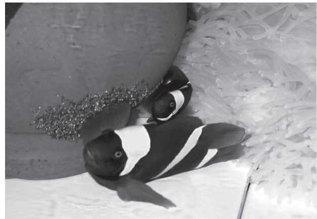
Fig. 2. Silvery eggs of Premnas biaculeatus on 6th day of incubation (just before hatching)