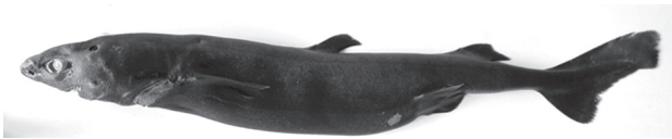
Fig. 1. Zameus squamulosus , 322 mm TL

length 3.83-3.89 in TL, pre-pelvic length 1.73-1.76 in TL, dorsal caudal space 8.74-8.89% TL, interdorsal space 15.22-17.28% TL, first dorsal fin length 9.84-10.41% TL, first dorsal anterior margin 7.91-8.06% TL, first dorsal base 5.56-6.01% TL, first dorsal inner margin 4.07-4.35% TL, second dorsal length 10.87-11.50, second dorsal inner margin 4.28-4.97% TL. First dorsal-fin origin about posterior to pectoral fin tip. Dorsal caudal margin 20.20-21.74% TL, pre-ventral caudal margin 10.57-11.91% TL. Second dorsal fin low and keel shaped. Second dorsal fin spine much larger than first. Upper teeth lanceolate. Dermal denticles leaf like with three longitudinal ridges. Uniform dark in colour.