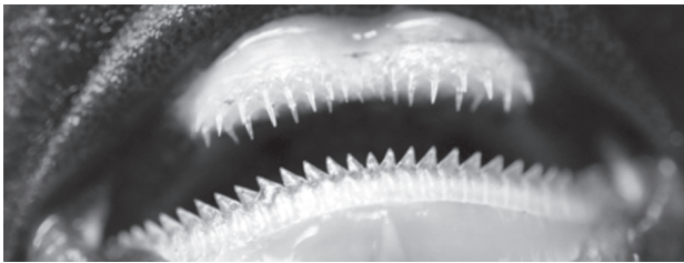
Fig. 2. Zameus squamulosus teeth image