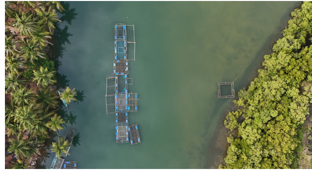
Fig. 1. Aerial view showing the study site and the IMTA unit

Seaweed production in India has traditionally been concentrated in the southern coastal states, particularly Tamil Nadu. Recognising the untapped potential along the Karnataka coast, ICAR-CMFRI initiated a pilot seaweed farming trial in the region during 2015-16.