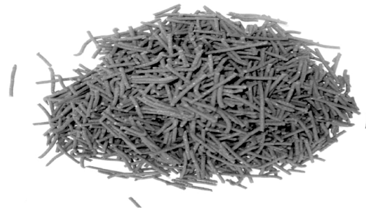
Fig. 1. Formulated pellet feed used in the study

pouches in triplicate and immersing in filtered seawater. The pouches were removed at an interval of 15, 30, 45 and 60 min, rinsed carefully in double distilled water, dried in a hot air oven at 60 °C and weighed. Leaching was minimal up to a time limit of 45 min. All the feeds were stable, retaining the shape and texture for about one hour. Dry matter loss recorded for all three diets was only 8-10% at the end of one hour.