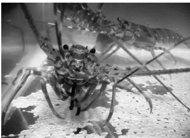
Fig. 2. P. homarus feeding on formulated pellet feed

The feeding schedule was fixed as three rations per day (30% were fed at 08:00 hrs, 30% at 14:00 hrs and 40% at 20:00 hrs) (Fig. 2). In the control tank (D), live clams were cut open and fed to the lobsters.