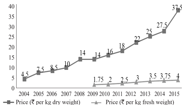
Fig. 3. Price of K. alvarezii in Tamil Nadu coast

₹4 and ₹37.50 per kg for fresh and dried seaweed respectively (Fig. 3). Majority of seaweed farmers earn around ₹50,000 to 1,00,000/- annually. The profit margin is 60% (Table 4). About 10% of the seaweed farmers earn an average annual income of more than one lakh rupees (Fig. 4). This finding indicates that kappaphycus farming provides substantial returns, which in turn helps to improve the livelihood of coastal fisherfolk.