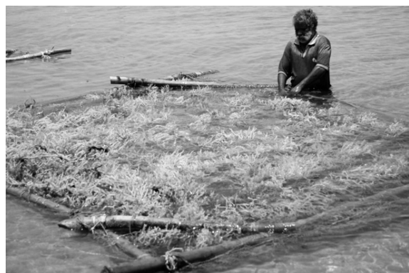
Fig. 2. Seaweed raft ready for harvest

₹4 and ₹37.50 per kg for fresh and dried seaweed respectively (Fig. 3). Majority of seaweed farmers earn around ₹50,000 to 1,00,000/- annually. The profit margin is 60% (Table 4). About 10% of the seaweed farmers earn an average annual income of more than one lakh rupees (Fig. 4). This finding indicates that kappaphycus farming provides substantial returns, which in turn helps to improve the livelihood of coastal fisherfolk.