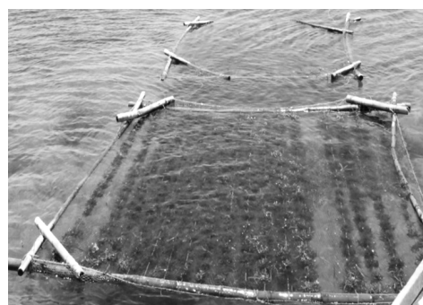
Fig. 1. Floating bamboo raft method of seaweed cultivation

Kappaphycus farming is being widely adopted employing floating bamboo raft method in Tamil Nadu coast (Fig 1). In a few places, tube net and monoline culture techniques are also being practiced for seaweed cultivation. The mainframe of floating bamboo raft is of 12’ × 12’. Four bamboo poles (each of 4’ length) are tied diagonally in four corners of mainframe. Nearly 20 polypropylene-twisted ropes along with seed materials are tied in the raft. Around 150-200 g of seaweed fragments are tied at a spacing of 15 cm along the length of the rope. A total of 20 seaweed fragments can be tied in single rope. The total seed requirement per raft is 60-80 kg. Fish net of 4x4 m size is tied at the bottom of the raft to avoid grazing. In normal season, a cluster of 10 rafts are positioned in the nearshore area of 1.0 to 1.5 m depth using a 15 kg anchor. During rough season, the same cluster has to be installed using two or three anchors.