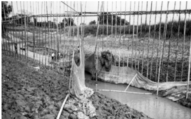
Fig. 2. Bundh fishing in a small canal

(which may go upto 5000 m in monsoon) are knitted to the series of bamboo poles from both sides of the canal bank. The remaining part of the net is then passed through the opening at the centre of the barrier and installed along the river (Fig. 2). The length of the tail portion of the net is around 500 m and is a pouch like structure. The fishes moving along with the water current are collected in this tail portion. Expert fishers can construct a bundh within a period of 10-15 days and such a bundh has an operational life of around 1 year. Fishes moving along the flowing water are obstructed by the barrier and enter the tail portion of the net where they are trapped. The strong water current prevents escape of fishes. The catch from bundh mainly comprised Indian major carps, minor carps, cat fishes particularly Wallago attu , Sperata aor and Mystus sp., small indigenous fishes namely Puntius sp., Amblypharyngodon mola , Gudusia chapra and small freshwater prawns. The average catch per unit effort (CPUE) was estimated at 3-4 kg h -1 and it was found to be a highly energy efficient fishing technique.