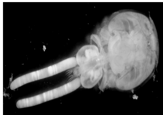
Fig. 2. Female Lepeophtheirus kabatai with egg capsule

Originally, Lewis (1968) collected this species from Epinephelus fuscoguttatus and Epinephelus kohleri and described it as Lepeophtheirus plectropomi . Later, Ho and Dojiri (1977) confirmed the specimen described by Lewis (1968) as a new species and named it as Lepeophtheirus kabatai . L. kabatai closely resembles L. plectropomi . In both species, size and shape are mostly similar and the main differences are in the shape of sterna furca, abdomen and second endopod segment in the third leg. The present