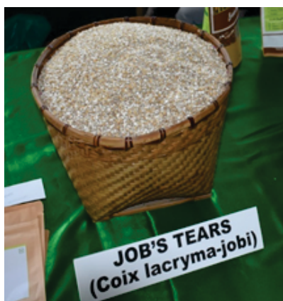
Fig. 4(a): Job's tears dehusked grains.

1990). Consumption of fermented beverages and alcoholic drinks has a deep-rooted history among different cultures. These drinks are widespread because of their nutritive value as well as the pleasure they impart, which makes them the most acceptable products for consumption during various religious or recreational rituals (Gogoi, 2021). The method of traditional alcohol brewing is different among the tribes as they follow their own unique protocol using distinct starter cultures, even though the majority of them use a similar base for fermentation (Tamang et al., 2016). The Zeliang tribe (Nagaland) use grinded grains for preparing local beer ' Hechi ' (Fig. 4b). For the purpose, local rice grains mixture is kept inside the dried seedless fruit of bottle gourd (locally known as Kela ) for a period of four days or up to one month (Fig. 5a) along with starter culture (locally known as 'medicine'). This beer can be kept for consumption till one week. The Ao tribe (Nagaland) prepares two grades (superior and inferior) of alcoholic drink. In superior grade, grains are boiled and 'medicine' (starter-which is a mixture of rice and fungal culture) (Fig. 5b) is added and kept for three days to initiate the fermentation process, while consumed when the froth comes out. Whereas in the inferior grade, the leftover mixture of grains from the superior one is crushed into a paste and water is added to make a drink before consumption. In the Angami tribe