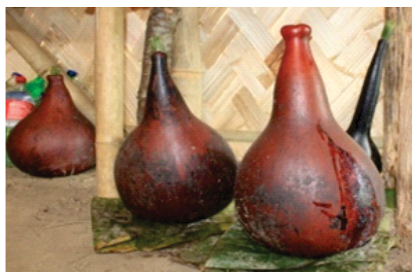
Fig. 5(a): Bottle guard in preparation of Job's Tears beer.