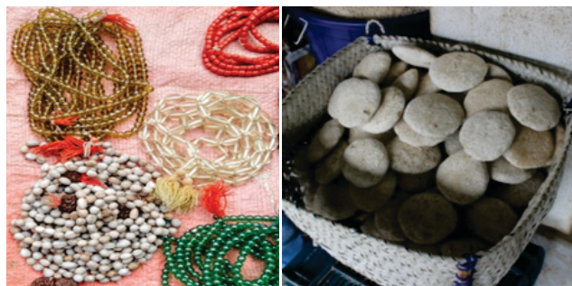
Fig. 6(a): Ornaments from the wild type of Job's tears.

Ethnic ornaments: Coix gives the most perfect beads for various ornamental purposes. The seeds obtained from wild types have been used by rural folks to make different kinds of ornamentals like earrings, rosaries, garlands, rings, bracelets, belts, photo frames, etc. Its seeds are an excellent source of natural jewellery as it has a hole in the centre through which wire or thread can easily pass. The traditional headgear of the Mizo women, called ' Vakiria ', is decorated with Coix seeds during celebrations (Laxmisha et al., 2022). Fifteen respondents from different tribes like Nyishi of Arunachal Pradesh; Paite tribe of Manipur; Jaintia of Meghalaya and Mizo of Mizoram have informed that chains, necklaces and bracelets are made from wild type of hard seeded Coix using strings; whereas in many places, its seeds are also used to decorate the belts (Fig. 6 a,b). The seeds can also be used in making musical instruments such as Shaker's gourd by covering hollow gourds with a loose net strung with beads of Coix (Anisuzzaman et al., 2007).