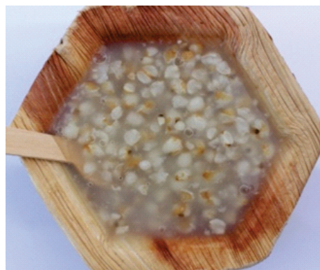
Fig. 5(b): Local recipes of Job's Tears.