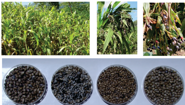
Fig. 2 (a): Job's tears cultivation in 'jhum' field! Fig. 2(b): Seed variability in Job's Tears.

Mizo - Pingpih; Mizo Lushai - Mim ; in Nagaland : Angami - Keshi; Ao - Menchong; Chakhesang - Kiise; Kachari - Lukuthui; Khamniungan - Linyak; Kuki - Mim; Pochury - Asheta; Rengma - Nsha; and Sumi - Akithi . These names are the manifestations of man's long-standing association with his surrounding green environment (Bareh, 2001). Local names given to plants by indigenous people in their local dialects often reflect a broad spectrum of information on their understanding. Most often, the local names are given based on some salient features, e.g., appearance, shape, size, habit, habitat, smell, taste, colour, utility, and other peculiar characters, etc. of the plants (Bhatt et al. , 2022). In earlier days, almost every household of the NEH region used to grow this crop, but presently it is vanishing from the entire jhum areas. A significant amount of genetic diversity from the farmer's field can be lost in future, if efforts are not made for its timely conservation ( ex-situ/in-situ on-farm) and use in breeding programme (Laxmisha et al. , 2022; Soni et al. , 2023). Hence, documentation of traditional knowledge associated with the crop is a need of the hour.