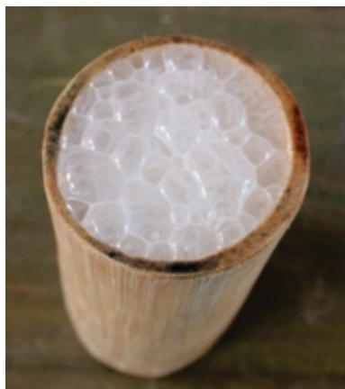
Fig. 4(b): Job's Tears beer ' Hechi ' of Zeliang tribe.