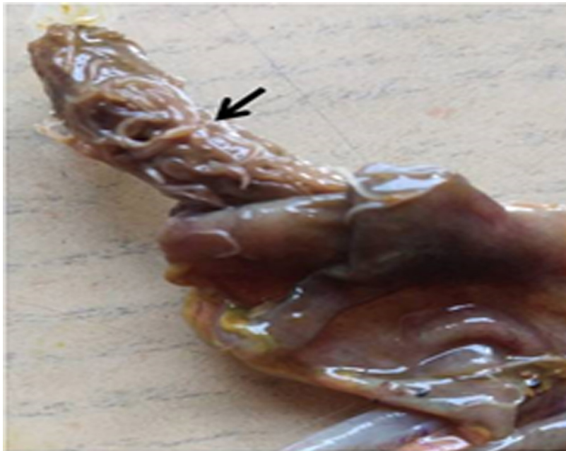
Fig. 2: Caecal lumen fully packed with Heterakis gallinarum worms (arrow)