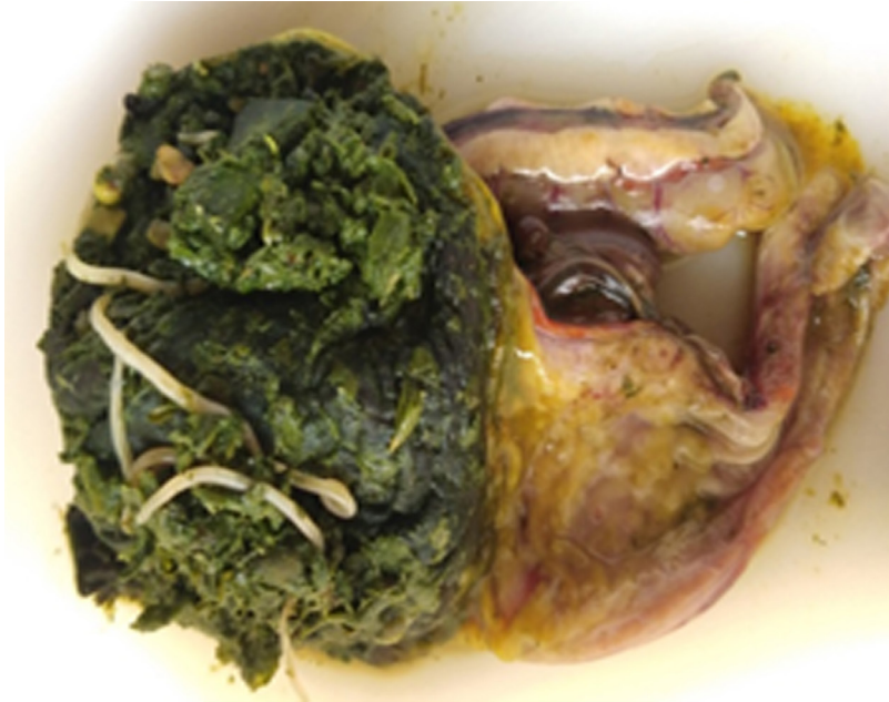
Fig.1: Ascaridiagalli worms seen in the gizzard