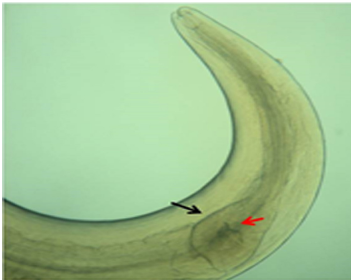
Fig. 4: Heterakis gallinarum head end (40X) showing oesophagus with prominent posterior bulb (black arrow) containing valvular apparatus (red arrow)