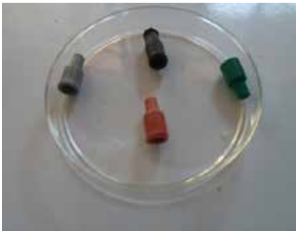
Figure – 1. (Z)-9-tricosene pheromone dispensers evaluated. a: Rubber septa dispenser, b: Silicone septa dispenser, c: Circular plastic green dispenser, d: Rectangular plastic dispenser, e: Circular plastic dispenser, f: Polyvial

The pheromone dispensers included septa, both rubber and silicone, plastic dispensers, circular plastic green lure and rectangular plastic dispenser and polyvial, a polythene dispenser (Sun lure, Ambattur, Chennai) (Fig. 1).