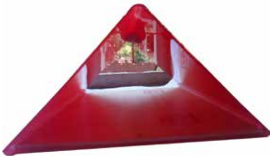
Figure – 2. Red acrylic delta trap used to evaluate the efficacy of (Z)-9-tricosene pheromone dispensers a: front view, b: top view

f sides of 11 cm with a 20.5 x 16 cm insert at the base where a transparent polythene sheet of 17 x 13.5 cm was placed and glue was applied uniformly on it. The pheromone lure was suspended in the middle of the trap using a thread. The trap was kept in the floor of the insectory for 1 h. At the end of 1 h, trapped flies were counted and sexed under stereo zoom microscope (Leica M-29-5, Switzerland). After each experiment, the delta trap was thoroughly washed in hexane thrice and then used.