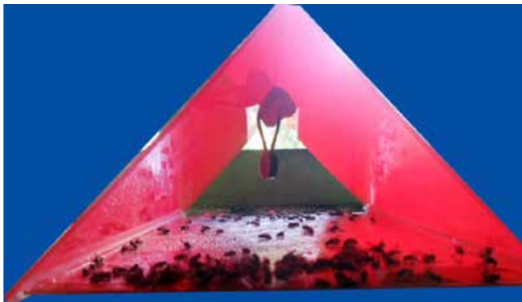
Figure – 3. House flies attracted towards circular plastic green lure

retain the pheromone without deterioration and evaporation thereby help in sustained release of (Z)-9-tricosene and luring of house flies.