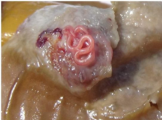
Fig 2. Cheilospirura hamulosa lodged in the ventriculus