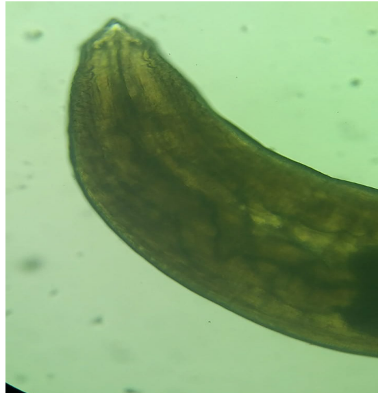
Fig 3. Cheilospirura hamulosa female worm with cordon at sides like decorations