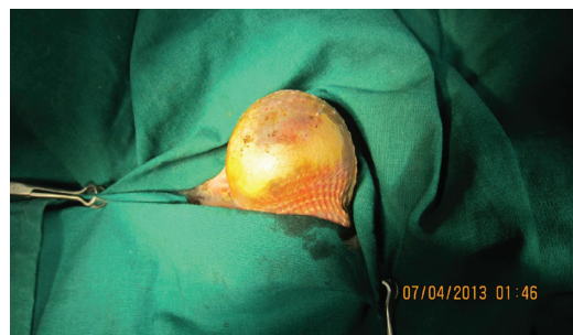
Fig. 4. Surgical site was prepared aseptically.