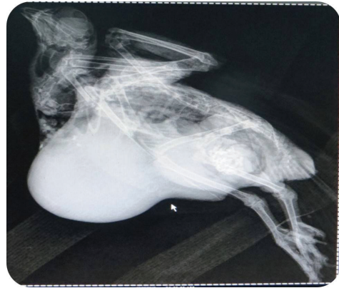
Fig. 2. Radiographic positioning of the bird and presence of soft tissue mass on the keel bone with no bony involvement

Surgical resection of tumour mass was performed under general anaesthesia. Food and water was restricted for 6h and 1-3h prior to surgery. The bird was pre-medicated with Atropine sulphate @ 0.04 to 0.1mg/kg b.wt IV (wing vein) and induced with ketamine @ 25mg/kg b.wt IM and diazepam @ 0.2 mg/kg b.wt IV. General anaesthesia was maintained with 2% Isoflurane in 100% oxygen through mask induction (Fig. 3). The surgical site was prepared aseptically (Fig. 4). The bird was positioned on dorsal recumbency. An elliptical incision was made over the tumour mass on the keel region (Fig. 5). The skin and fascia was removed. The tumour mass was resected from the keel bone (Fig. 6). No gross lesions of metastasis in other organs during the surgery. The subcutaneous tissues were closed in continuous suture pattern with PGA 2-0. The skin was sutured with 2-0 PGA by cross mattress pattern (Fig. 7). No intra-operative complications occurred during the surgery.