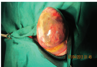
Fig. 5. Elliptical incision was made over the tumour mass on the keel region.