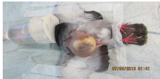
Fig. 3. The bird was prepared for surgery under general anaesthesia.

Surgical resection of tumour mass was performed under general anaesthesia. Food and water was restricted for 6h and 1-3h prior to surgery. The bird was pre-medicated with Atropine sulphate @ 0.04 to 0.1mg/kg b.wt IV (wing vein) and induced with ketamine @ 25mg/kg b.wt IM and diazepam @ 0.2 mg/kg b.wt IV. General anaesthesia was maintained with 2% Isoflurane in 100% oxygen through mask induction (Fig. 3). The surgical site was prepared aseptically (Fig. 4). The bird was positioned on dorsal recumbency. An elliptical incision was made over the tumour mass on the keel region (Fig. 5). The skin and fascia was removed. The tumour mass was resected from the keel bone (Fig. 6). No gross lesions of metastasis in other organs during the surgery. The subcutaneous tissues were closed in continuous suture pattern with PGA 2-0. The skin was sutured with 2-0 PGA by cross mattress pattern (Fig. 7). No intra-operative complications occurred during the surgery.