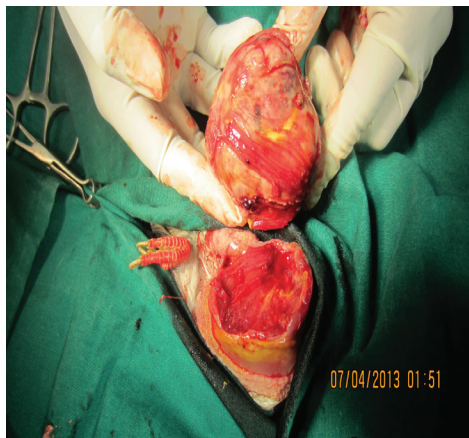
Fig. 6. Surgical resection of the tumour mass.