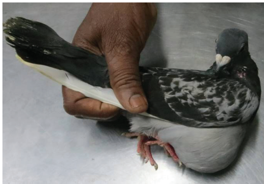
Fig. 1. Large tennis ball size soft tissue on the keel region.

A three years old male pigeon weighing 400g (racing homer) was presented to Madras Veterinary College Teaching Hospital with the history of soft tissue growth on the keel region for the past six months and gradually increase in size was noticed. Physical examination revealed large tennis ball size soft tissue mass on the keel region (Fig. 1). Cytological examination revealed the presence of inflammatory cells with serosanguineous background. Radiological examination revealed presence of soft tissue mass on the keel bone with no bony involvement (Fig. 2).