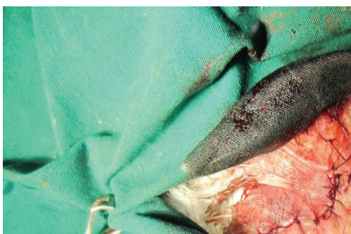
Fig. 7. The skin was closed by cross mattress pattern.

The excised tumour sample was collected in 10% formalin and sent for histopathological examination. Histopathological examination of the tumour mass revealed presence of polyhedral shape, vacuolated multiple fat cells and immature adipocytes. Histopathological examination confirmed liposarcoma (Fig. 8).