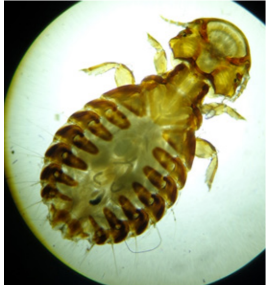
Fig. 2. Goniodes pavonis female