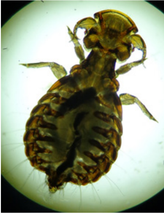
Fig. 1. Goniodes pavonis male