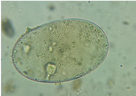
Fig. 3. Egg of Sarcoptes scabiei (100 X)