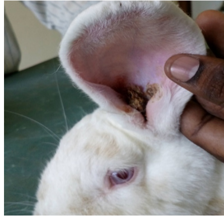
Fig. 2. Rabbit with crusty ear lesion