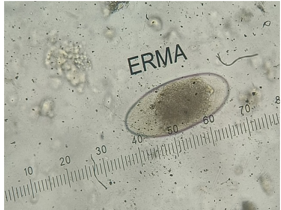
Fig. 8 Egg of Psoroptes Cuniculi (100X)