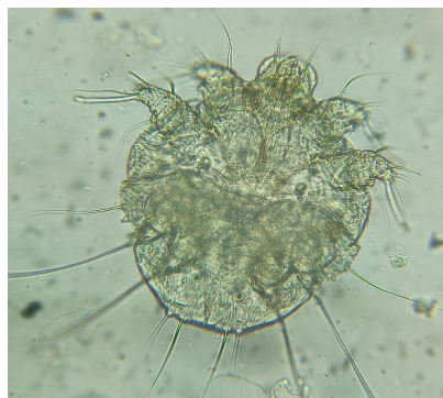
Fig. 6. Adult S. Scabiei mite (100 X)