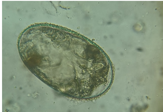
Fig.4. Larva in S. scabiei egg (100 X)