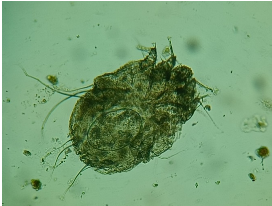
Fig. 7. Adult female S. Scabiei with egg (100X)