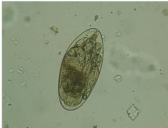
Fig.9 Larva in P. Cuniculi egg (100X)