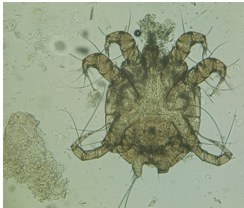
Fig. 11 Adult male P. Cuniculi mite ( Copulatory tubercle ) (100X)