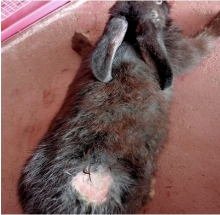
Fig. 1. Rabbit with alopecia in the hip region