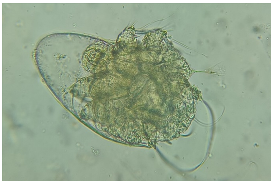
Fig. 5. Release of S. scabiei larva (100X)