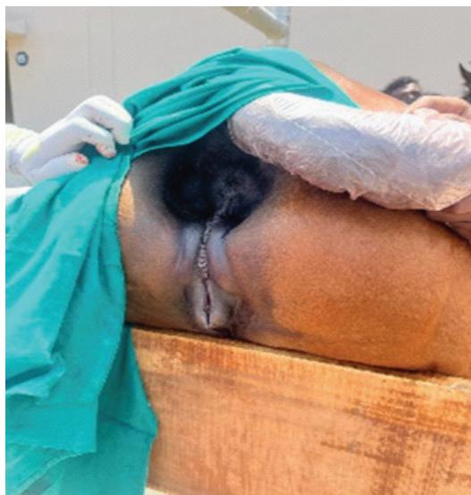
Fig. 2 After Caslick's Operation