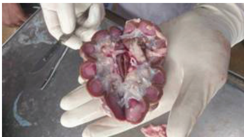
Fig.3. Dissected fetal kidney