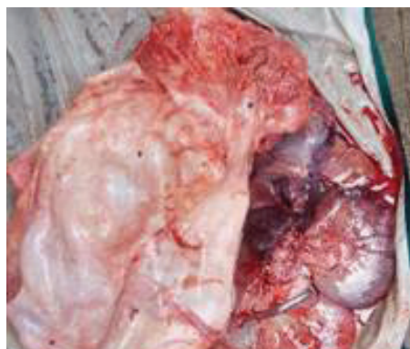
Fig.1. Encapsulating membranous pouch around the schistosomus reflexus fetus

Schistosomus reflexus is a well-documented congenital anomaly in ruminants, characterized by severe ventral curvature of the spine, ankylosed limbs, malformed pelvis, and exposure of thoracic and abdominal viscera (Ravikumar et al. , 2014; Palanisamy et al. , 2018). While most cases require fetotomy or caesarean section due to the size and rigidity of the malformed fetus, smaller-sized monsters, as in this report, may be delivered per vaginam with appropriate obstetrical assistance (Selvaraju et al. , 2020). Similar cases have been described in buffaloes (Kumar et al. , 2015) and goats (Suthar et al. , 2011), highlighting the cross-species occurrence of this anomaly.