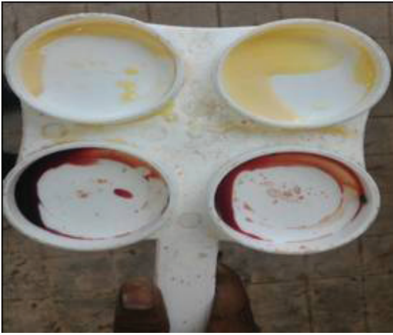
Fig .1. California Mastitis Test (CMT) results from milk samples of affected quarters.