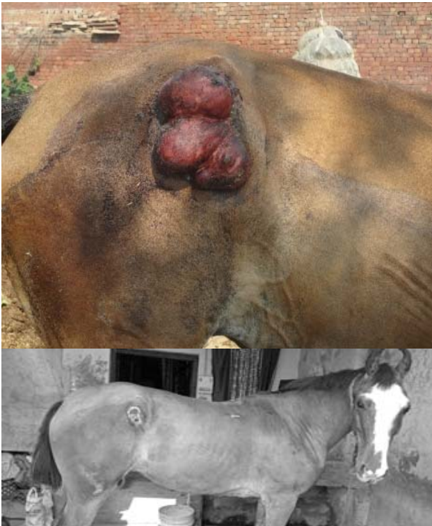
Fig. 2: Another horse with exuberant granulation tissue, before and after treatment.

along with similar protocol of antibiotics and analgesics.