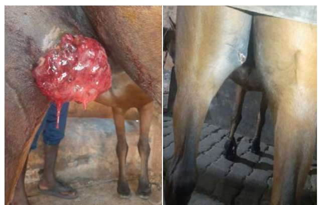
Fig. 1: Exuberant granulation tissue in a horse before, and after treatment

Postoperative care included application of pressure bandage with corticosteroid ointment, and administration of inj. procaine penicillin (22000 IU/kg body wt., i.m., OD) and inj. phenylbutazone (4.4 mg/kg body wt., i.v., OD) for 5 days. Bolus Serratiopeptidase OD was advised for 7 days. Small growths recurred were treated with cauterization, pressure bandaging with corticosteroid ointment,