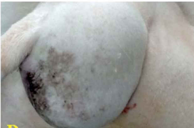
Fig. 1: A - Animal exhibited severe swelling in the right perineum

Postoperatively the dog was treated with tab. cephalaxine (15 mg/kg body wt.) for five days, tab. meloxicam (0.2 mg/kg body wt.) for three days and tab. finasteride (0.5 mg/kg body wt.) for 3 months administered orally along with stool softeners. The skin sutures were removed on 10 th postoperative day. The haemato-biochemical parameters returned to normal range by 10 th day.