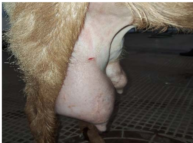
Fig. 1: Udder showing subcutaneous swelling indicating udder oedema

A 3-year-old Sirohi goat with history of udder swelling was presented just after kidding. The goat was in 4 th parity, clinical examination revealed udder oedema on both half of the udder but more on right udder and teat (Fig. 1). The rectal temperature was 102°F, and the surface temperature of udder was slightly lower than the normal when palpated manually. Feed and water intake was slightly decreased while the defecation and urination were normal.