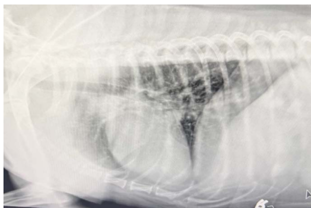
Fig. 2: Lateral radiograph of thorax shows miliary pattern, suggestive of metastatic lesions.