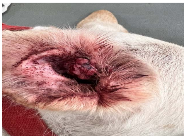
Fig. 1: Nodular mass in right ear.

Microscopically was characterized by the presence of large, pleomorphic nuclei containing prominent nucleoli, intracytoplasmic vacuolations