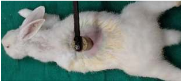
Fig. 1: Infliction of burn wound on the dorsum of the rabbit using a circular brass apparatus.