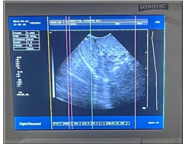
Fig. 2 Hypoechogenicity of thyroid gland (arrows)

in mountainous and sub-mountainous regions of India iodine deficiency during pregnancy may be the cause in this instance and has particularly harmful effects like retardation of foetal development, retarded growth and birth of weak or dead newborns with goitre (Vijlder, 2003). Since the body is unable to synthesise iodine, the main source of iodine the diet (Kotwal et al. , 2007). The severity of a diet-related iodine deficiency may have contributed to this case's outcome. The focus was on improving the kid's condition and preventing further loss in subsequent gestations by giving the goat extra iodine supplements.