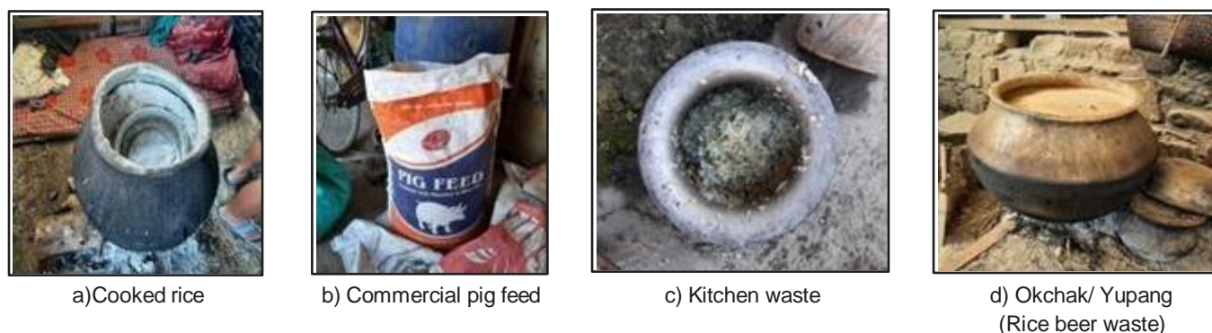
Fig. 1 Common feed ingredients