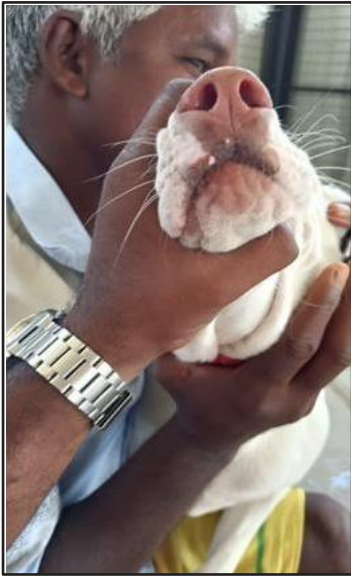
Fig 1. At the first dose of the treatment showing papilloma in the upper Jaw