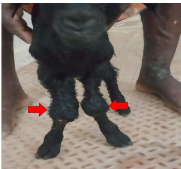
Fig. 1: Kid presented with swelling in joints